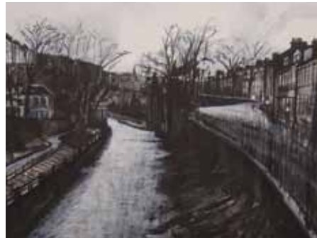
Twilight over St. Bernard's Well 24cm x 31cm, Indian ink on paper