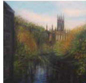
Autumn reflections 30cm x 30cm, Oil on board