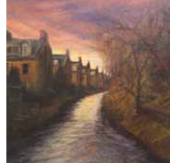
Winter skies over The Colonies 30cm x 30cm, Oil on linen