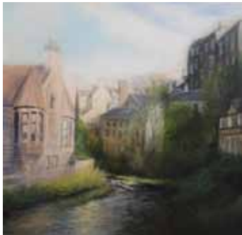
Reflections in The Dean Village 30cm x 30cm, Oil on board