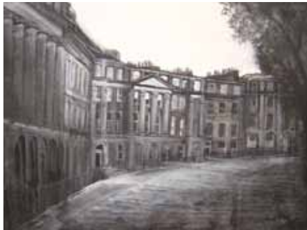
Moray Place 24cm x 31cm, Indian ink on paper