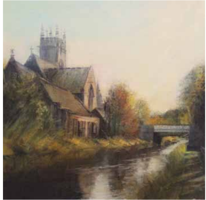
Polwarth Church 30cm x 30cm, Oil on linen