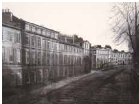
Drummond Place 24cm x 31cm, Indian ink on paper