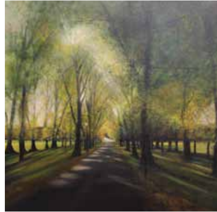
Autumnal light on Middle Meadow Walk 50cm x 50cm, Oil on canvas