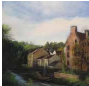
Afternoon shadows in The Dean Village 30cm x 30cm, Oil on board