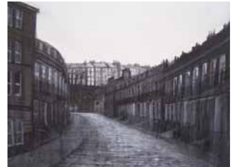
Danube Street 24cm x 31cm, Indian ink on paper