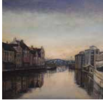
Still waters in Leith 30cm x 30cm, Oil on linen