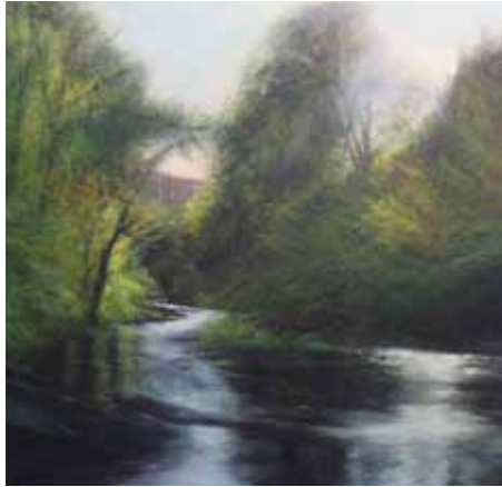
Light and shade on The Water of Leith 50cm x 50cm, Oil on canvas