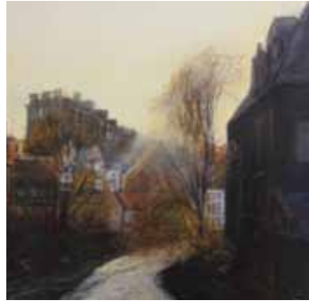
Late afternoon in The Dean Village 30cm x 30cm, Oil on board