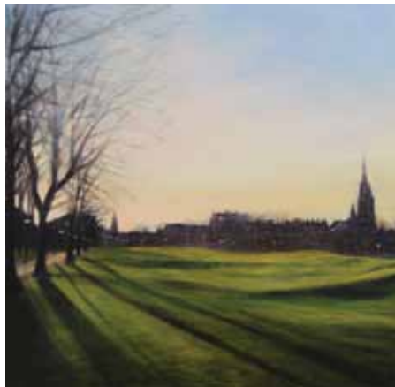
Light shadows on The Meadows 30cm x 30cm, Oil on linen