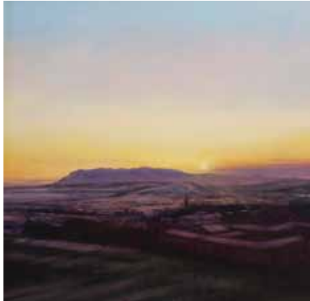
Pentlands skyscape 50cm x 50cm, Oil on linen