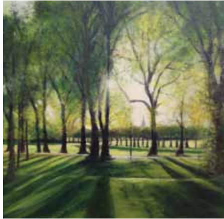
Ethereal light through The Meadows 30cm x 30cm, Oil on linen