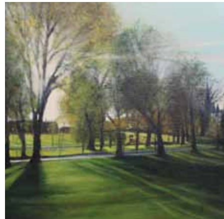
Light reflections on The Meadows 30cm x 30cm, Oil on linen