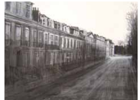
Heriot Row looking towards Abercromby Place 24cm x 31cm, Indian ink on paper