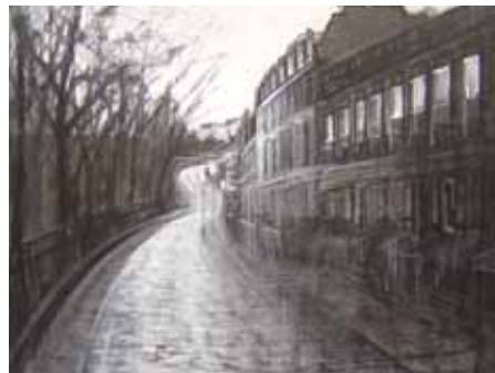
Dean Terrace 24cm x 31cm, Indian ink on paper