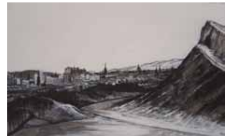
City skyline from Arthur's Seat 30cm x 47cm, Indian ink on paper