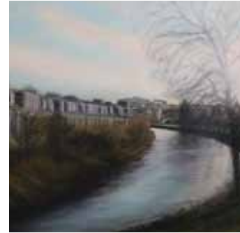
Light falling on The Water of Leith 50cm x 50cm, Oil on board