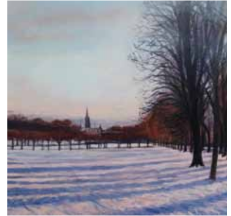
Snow reflections 30cm x 30cm, Oil on board