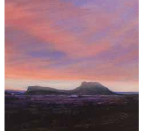
Winter clouds from Blackford Hill 30cm x 30cm, Oil on linen