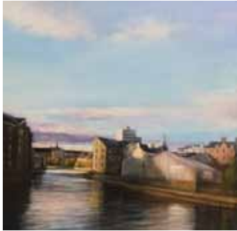
Winter skies over Leith 30cm x 30cm, Oil on linen