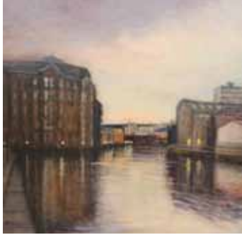
Light breaking over The Shore 30cm x 30cm, Oil on linen