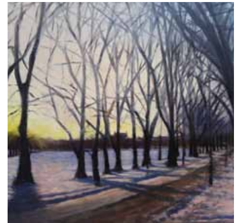
Winter on Middle Meadows Walk 30cm x 30cm, Oil on board